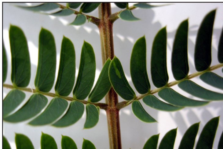
Figure 2. Compound leaves of lead tree.