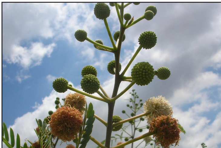
Figure 4. A group of lead tree flowers.