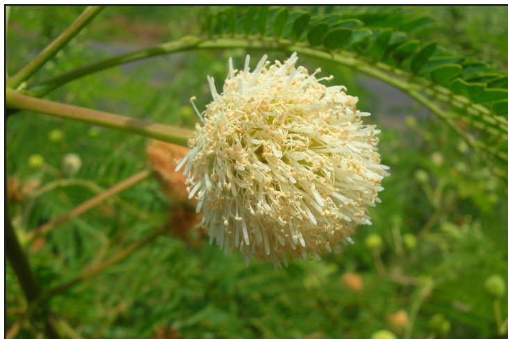
Figure 3. Close-up of a lead tree flower.