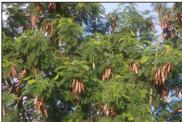
Figure 6. A mature lead tree with seed pods.