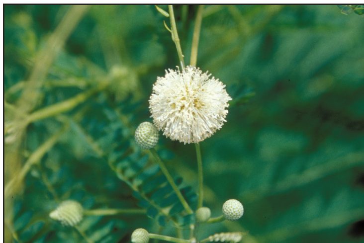
Figure 5. A lead tree flower.