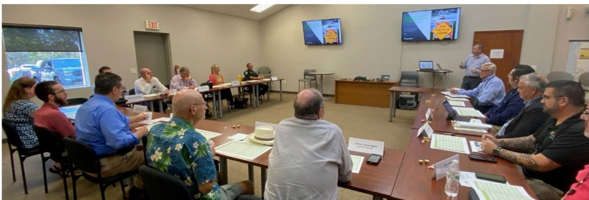
Stakeholder Group for the Vulnerability & Risk Assessment Study for Transportation Infrastructure (2023)

Lecanto Government Building 3600 W. Sovereign Path, Room 166 Lecanto, Florida 34461 Time: 9:00 a.m.