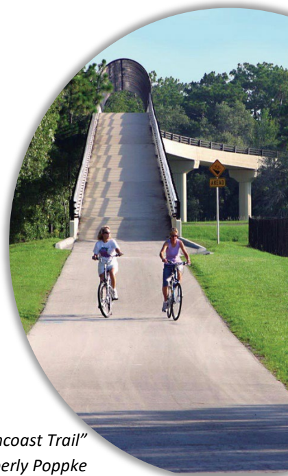
“Bicycling on the Suncoast Trail”